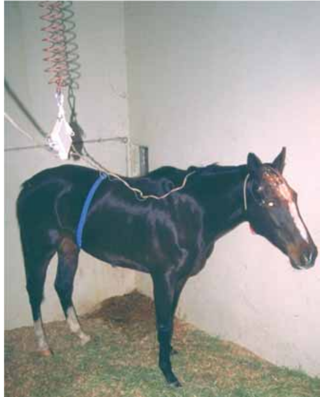
Fig. 1. Twenty-four-hour EEG and video monitoring system at the Veterinary Medical Teaching Hospital at the University of California at Davis. Note the EEG electrodes in the horse's head. The horse is still free to move around the stall.

Various factors such as difficulty in studying the behavior of sleep along with EEG, lack of telemetric EEG units that would record from a distance so as not to interfere with the horses' natural activities, and maintenance of EEG electrodes for long periods of time in a natural setting limit sleep studies in the horse. As a result, very little information is available on natural sleep in the horse. There are few "in-doors" sleep studies (Fig. 1). 8 Our studies included adapting horses for a period of 1 wk to stall confinement before EEG sleep study. Horses were clinically and neurologically normal. Personnel and equipment were isolated from horses. A cable installed across the stall allowed the electrode input box to be suspended on a movable wheel, which enabled the horse under study to move freely in the