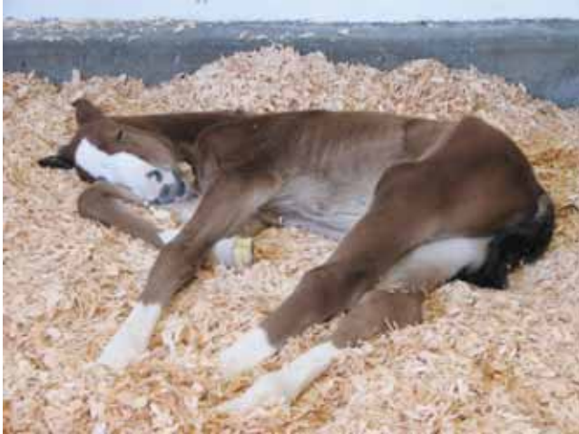
Fig. 4. REM sleep in a neonate.

lie down and go into REM almost immediately. Although it may be tempting to call this sleep-onset REM sleep (SOREM), it is probably more closely related to microarousals, a normal finding in human sleep.