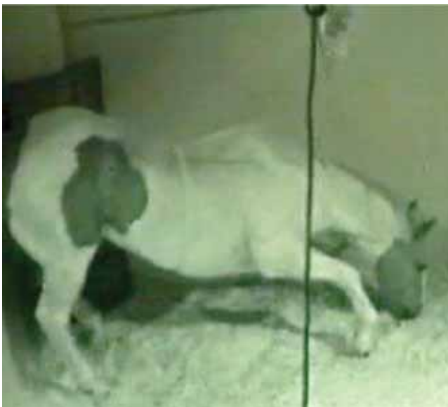
Fig. 5. Partial collapsing episodes when REM sleep occurred while standing. 8

Sleep deprivation can be manifested in the horse as excessive daytime sleepiness and collapsing episodes (not to be confused with narcolepsy and catalepsy). 12 Like man, horses may be subjected to a variety of factors that can result in loss of sleep. Examples include environmental stress (excessive noise, extreme temperatures, and unfamiliar/unsafe territory), rank in the herd, and not lying down (lack