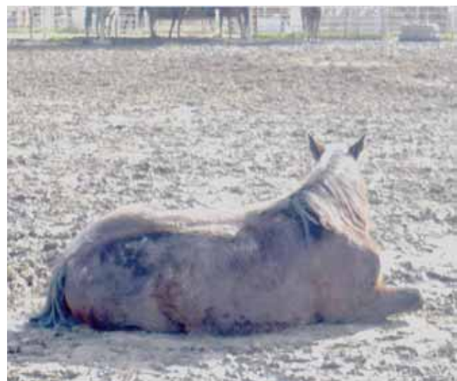
Fig. 3. Horse in SWS while in a sternal position.

only 15% (~30 min/day) of their total sleep time to REM sleep. Lateral recumbency (Fig. 4) is commonly adopted, but sternal recumbency has also been observed. Recumbent REM sleep can be quite dramatic and may be confused with seizures. Some of the observed features during REM sleep may include paddling, twitching, blinking, developing rapid eye movement, ear twitch, and flaring nostrils. Brief segments of standing REM sleep have been documented, but the accompanying loss of muscle tone precludes extended periods of observation. Numerous partial-collapsing episodes related to REM sleep were observed in one of our research horses that refused to lie down (Fig. 5). 8 Horses that are standing during SWS have been known to