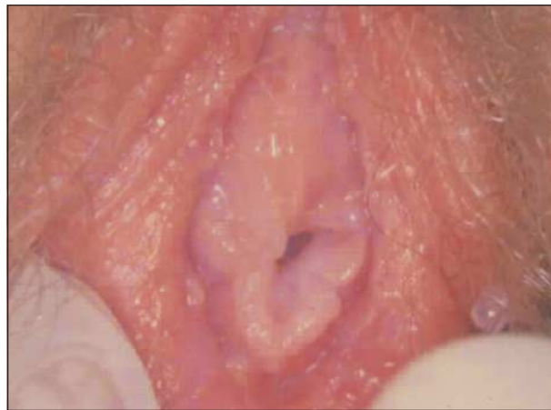
Figure 1. Photograph at \times 10 magnification, showing a 19-year-old subject who admits to having consensual intercourse. Any notches or clefts in the hymen are unable to be clearly seen in this view.

Because the examiner was able to manipulate the hymenal tissue during the examination and make nota-