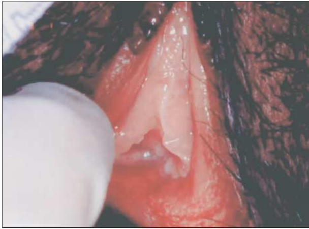
Figure 3. A 19-year-old subject with no history of past sexual intercourse (subject 45). She described the painful insertion of a tampon on 1 occasion. A complete cleft was seen in the hymen at the 6-o'clock position during the examination, but it was not as clearly documented in the photograph, taken at \times 10 magnification.