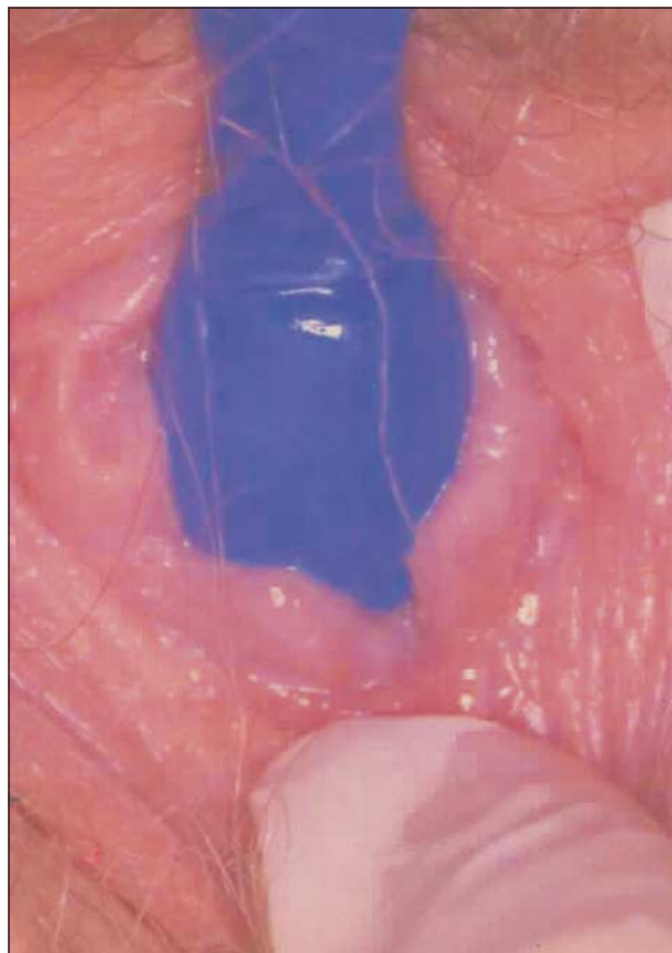
Figure 2. The same subject as in Figure 1. A large cotton swab covered with a small latex balloon was used for contrast. A complete cleft in the hymen at the 5-o'clock position is clearly demonstrated.

‡Deep notch refers to a defect extending through more than 50% of the width of the hymen; complete cleft, a defect extending all the way through the width of the hymen.