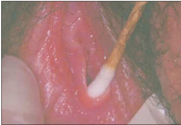
Figure 4. A 16-year-old sexually active subject who admits to consensual sexual intercourse. No notches or clefts were visible in the hymen during examination. The subject was able to relax and allow stretching of the hymenal rim with a cotton swab. The photograph was taken at \times 10 magnification.

more. Table 2 presents a comparison of the number of subjects with 0 to 1 and 2 to 4 notches or clefts in the posterior or lateral locations and between subjects with and without a history of sexual intercourse, using the Fisher exact test.