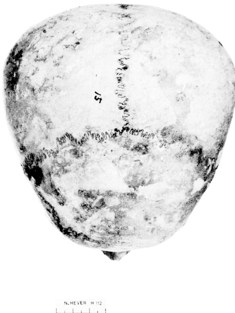
Figure 3. — Natural « trigonocephaly », Nahal Hever Israël

Concerning artificial cranial deformation, our reexamination of the crania from Lachish strongly indicates that at least some of the skulls described by Risdon (1939) as artificially deformed, actually present a normal, undeformed cranial shape commonly found among diverse populations of the Middle East. In only one skull from Lachish is the retreated frontal bone associated with a post-coronal transverse groove that suggests bandage marks indicative of artificial deformation, ( see fig. 2 ). In fact, the incidence of cranial deformation in the entire ossuary of Lachish was actually very low (ca. 1 %) whereas among groups normally practicing cranial deformation, the whole population tended to be involved (e.g. Armenians, Maronites, Pueblo Indians, etc.)